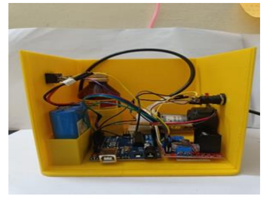
Fig.3. Medicine Dispensing device

The dispensing unit housing is modelled using Solid works software and 3D printed. All the parts of the assembly fixed in the housing and circuit connections are made. A code to operate the unit automatically with a simple switch is uploaded into the controller board and the pump dispenses the syrup as per the set quantity and flow rate. A pipe from the pump inlet end is inserted in syrup bottle and the second pipe attached to the outlet end of the pump. This outlet pipe delivers the syrup of prescribed quantity in millilitres into a measuring cup. The flow rate of the syrup from the bottle into the cup is monitored using communication from controller to a suitable monitor. A light weight 12 V battery is used to run the motor. The functioning of the unit is tested a good number of times to verify and compare the flow rate and actual out flow of the syrup. A push button is installed, which actuates and de-actuates the device. An LED and a buzzer are also included in the circuit to indicate the start and end of the syrup flow from the device. The total volume of the unit is 12 Cm X 6 Cm X 8 Cm. Picture of the assembled unit is replaced with a container of hot water. Rinsing two or three times after using one type of syrup is recommended and rinsing is very simple and quick. Tested well for the quality of rinsing too.